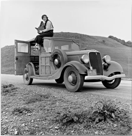
(Dorothea Lange atop automobile in California, 1936)

“Photography takes an instant out of time, altering life by holding it still. ~ Dorothea Lange