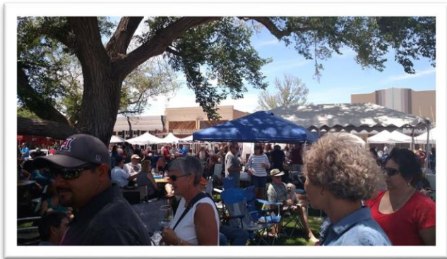
(2016 Spring Willcox Wine Festival)