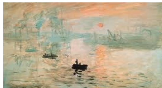
Claude Monet Impression, Sunrise 1872, oil on canvas, 49cm x 63cm; Musee Marmottan Monet, Paris