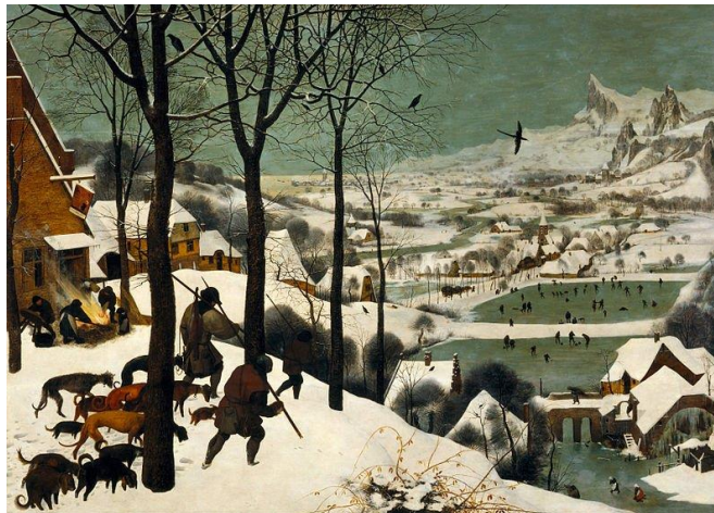
Pieter Bruegel the Elder, 1565, Oil on wood panel, 46 in × 63 ¾ in, Kunsthistorisches Museum, Vienna, Austria