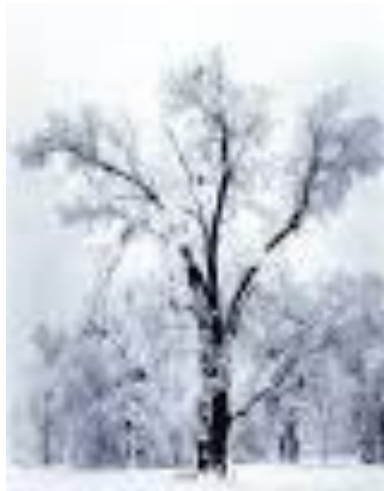
Ansel Adams, Oak Tree, 19487, photo, Yosemite NP, CA