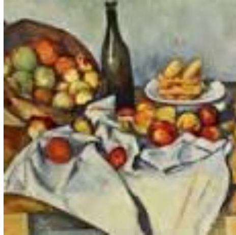
Paul Cézanne (b. Jan. 19, 1839) The Basket of Apples o/c 25 7/16 x 31 1/2 in. Art Institute of Chicago

The Art League Artist of the Month for January is Yolanda van ver Lelij.