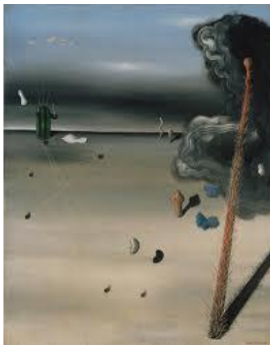
Yves Tanguy (b.Jan.4, 1900) Mama Papa is Wounded o/c 1927 36 1/4 x 28 3/4" MOMA

MONTHLY MEETING NOON BRASS RAIL ROOM AT DOC'S THE PLAZA RESTAURANT WEDNESDAY, JAN. 8, 2014