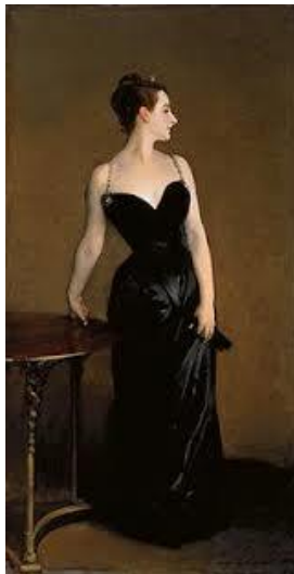
John Singer Sargent (b. Jan. 12, 1856) Madame X (Madame Pierre Gautreau) , 1883–84 o/c; 82 1/8 x 43 1/4 in. Metropolitan Museum of Art

It is time to be thinking ahead for the spring show. All you artists are, I hope, hard at work on your entries. Photographers should be snapping away. It's never too early to be thinking about your entries. Also, even if you aren't entering the miniature show, be sure to drop by the Visitor's Center during February and look at the entries. There is always some amazing work.