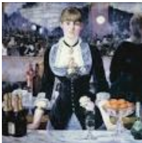
Edouard Manet (b. Jan. 23, 1832) The Bar at the Follies Bergere 1881-2, o/c 37.8 in x 51.2 in) The Courtauld Institute

Info on the Sulphur Springs Valley 17th International Miniature and Small Works Art Show, to be held in Willcox on February 4th - 28th, 2014.